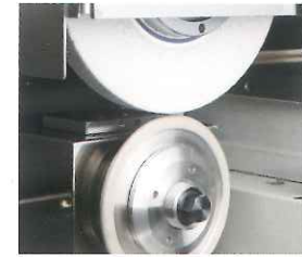
■ On Machine Rotary Dresser